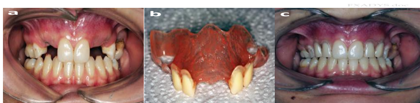
Figure 3. (Yavuz and Aykent, 2012) a. Missing maxillary anterior teeth on 12,13,22,23 b. Thermoplastic nylon flexible RPD c. Final prosthesis

In patients who wear nylon denture base with no occlusal support, should the denture sink then the resin clasp compresses the marginal gingiva, potentially causing its