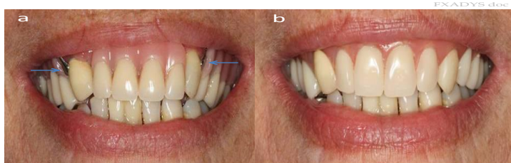
Figure 2. (Gomes et al, 2014) a. Old conventional acrylic RPD with visible clasp b. New thermoplastic nylon flexible RPD